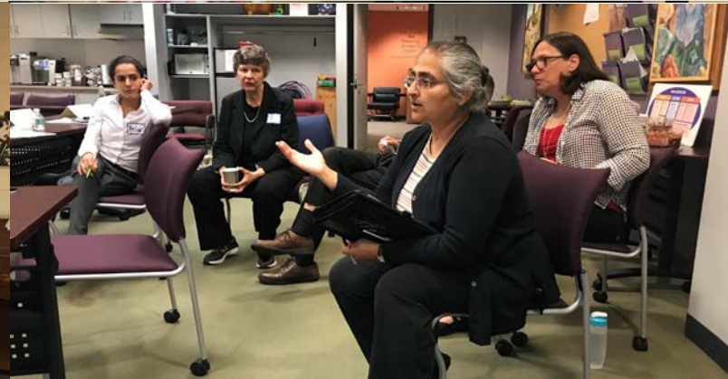
Juvenile Harassment Mediation Training for MWMS and CDSC Mediators