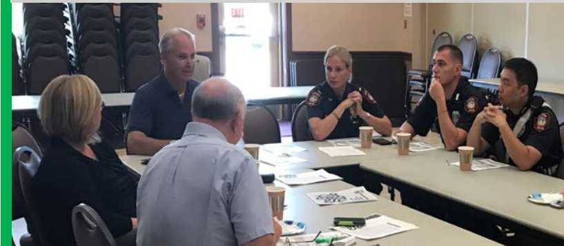
Dialogue Forum on Community – Police Relations