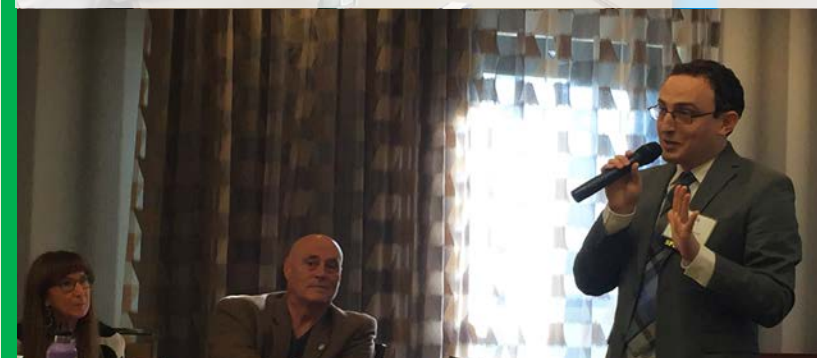
Presentation on Conflict Resolution Skills to Alumni of Leadership MetroWest

I wanted to extend a sincere thank you to [your mediator] for successfully mediating a case which I was a little unsure would work out when I made the referral. She worked her usual magic in the mediation room, and the parties were able to reach an agreement on a case where no one would have benefited from a litigated hearing.