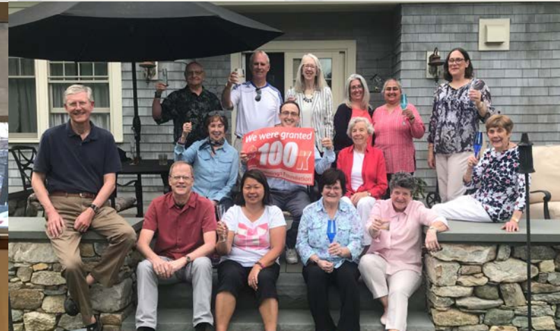
Celebration of Retiring Mediators and the Cummings Foundation Grant