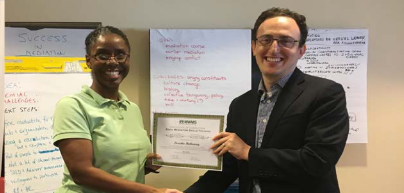
35-Hour Mediation Training for 12 Framingham State University Administrators