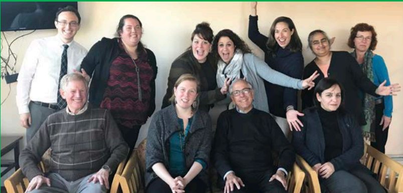
35-Hour Mediation Training for 9 Community Members