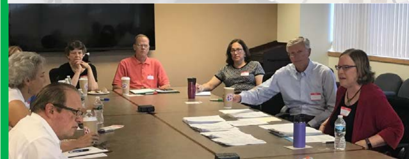
Workshop for Divorce Mediators on New Child Support Guidelines